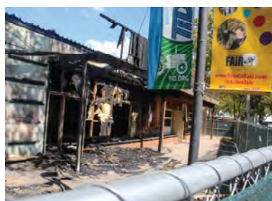
Crispy Building Fund